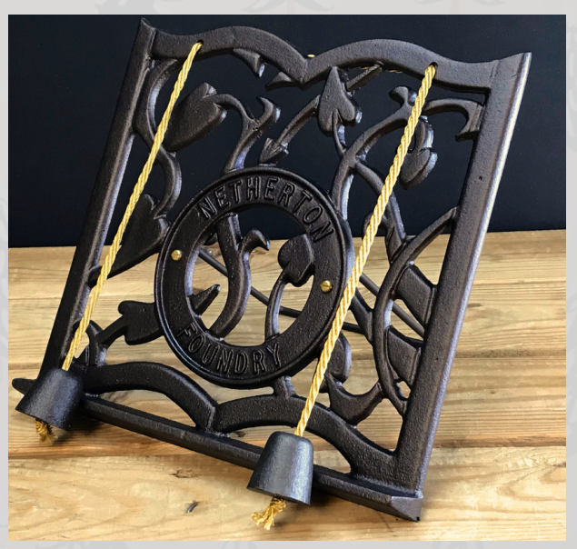
3. DOUBLE CROUSTADE IRON NFS-344 4.COOKERY BOOK STAND NFS-122